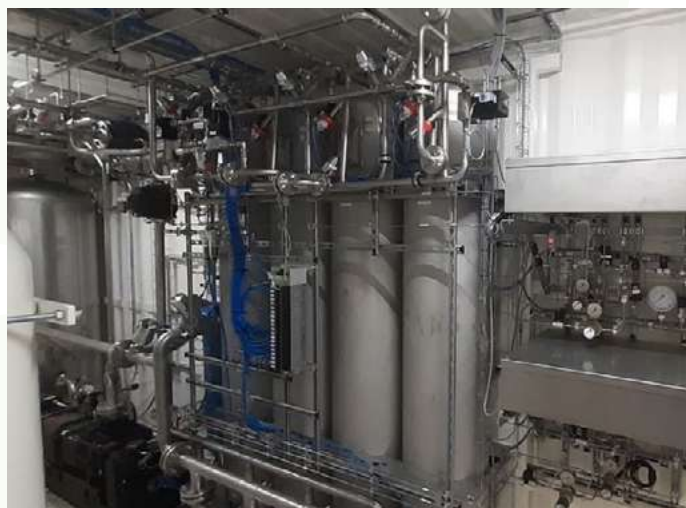
Installed To-Syn-Fuel PSA.

In mid-June 2020, the PSA construction was finalized, the software loaded and the container ready for shipment to the To-Syn-Fuel plant in Hohenburg in Bavaria, Germany. The system has been installed during this summer. The commissioning phase is ongoing.