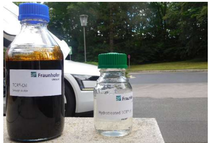
TCR® bio-oil (black coloured) and hydrotreated TCR® bio-oil (colourless).

In the HDO process, developed by our project partner VTS, clean PSA hydrogen and TCR® bio-crude oil are mixed and heated before entering a reactor, where the hydrogen together with the bio-oil (black coloured -see figure) is converted into hydrotreated bio-oil (colourless -see figure). It is a thermally stable oil, therefore can be directly processed with the hydrogen. The oxygen, the sulphide and the nitrogen are rejected to result in an almost pure hydrocarbon which can be fractionated in to diesel and gasoline fractions.