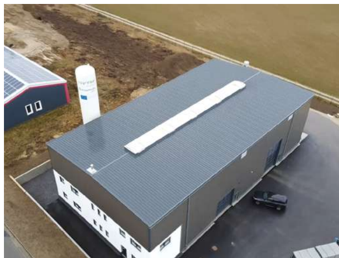
Pilot plant for the To-Syn-Fuel project in Markt Hohenburg, district of Amberg-Sulzbach.

Moreover, the quantities and quality of input material required in the project are readily available in Hohenburg. In fact, the service of the local supplier includes the daily and on-demand amount of dried and pre-treated sludge to the demonstration site.